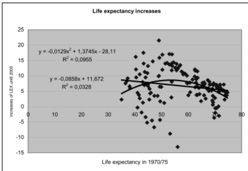
Graph : life expectancy levels in 1970/75 and life expectancy increases 1970 - 2000

It emerges that the Islamic countries are among the best performers on this scale (i.e. as measured by the residuals from the non-linear equation in the entire world system). The countries in the Map marked in dark colors are really those where growth (or stagnation) was in benefit for the poor, while the countries, marked in white colors, are the ones where growth (or stagnation) did not benefit the poor, irrespective of life expectancy levels reached back in 1970.